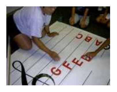
The Note-Reading class places letters on the giant staff.

This summer you can save $$$ and double your fun at Keiki Kani. If you're registering for our music, piano, choir classes, Bring-A-Buddy and you and your buddy can each take $15.00 off your tuition cost OR take advantage of our Double-